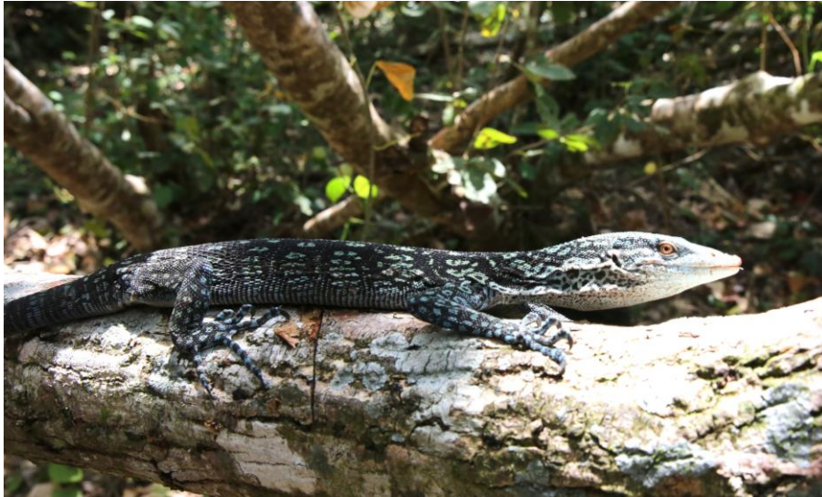
Figure 2. Blue tree monitor, Varanus macreii in its habitat on Batanta Island

Due to the increasing international trade, some concern on the decline of wild population and sustainability of trade was raised by conservationists leading to the categorisation of Blue tree monitor as “Endangered” in the IUCN Red List of Threatened Species (Shea et al. , 2017).