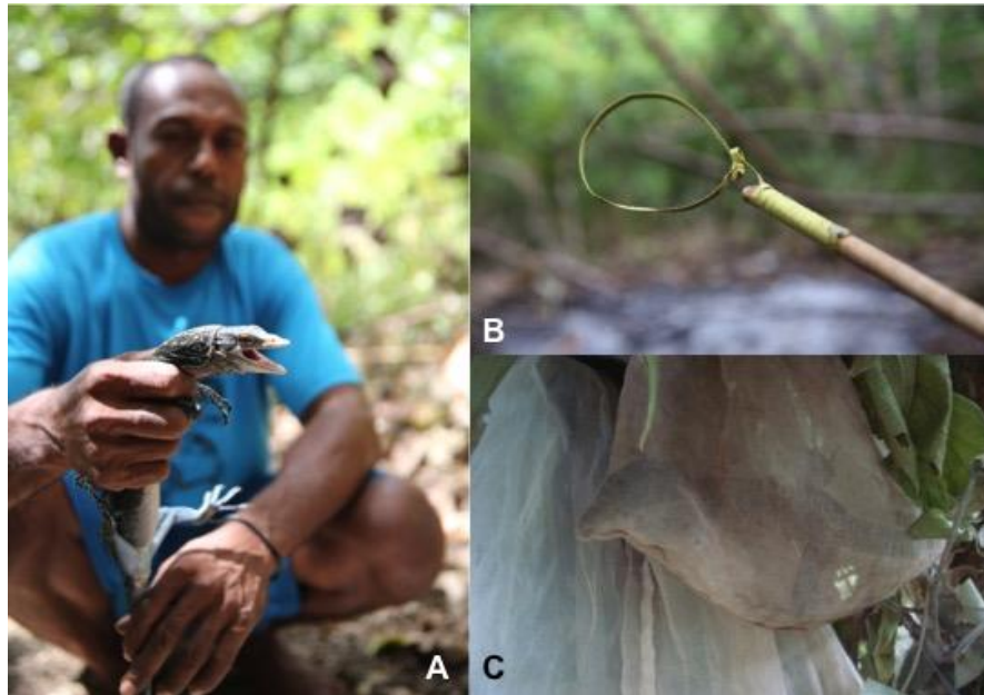
Figure 3. A. a hunter with a Blue tree monitor, B. bamboo noose, C. Peach-throated monitor caught as side target

Hunters usually go for their search in groups of four to five people for about one week and camp out before returning to Amdui with their catch. These Amdui men mentioned they used to go for their hunts nearby the village; however they started to go further west on Batanta since a few years because lizards are easier to find in these new locations. By the year of 2007, the Blue tree monitors were already hard to locate on Ayem Island (Figure 4), which lies just off Amdui on Batanta (Del Canto, 2013). Hunters further mentioned that it was easy for them to spot and catch the lizards in their gardens in the early 1990s.