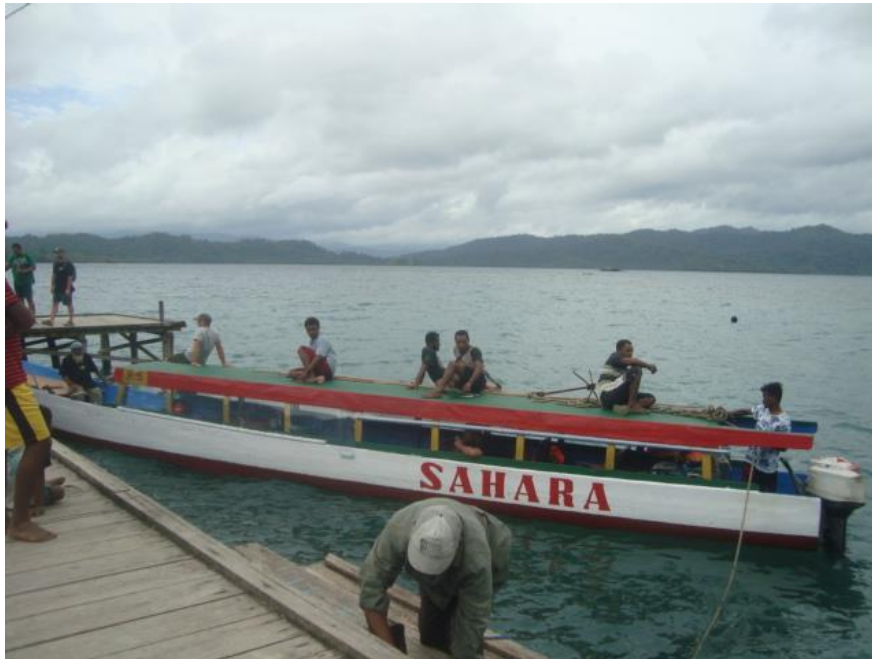
Figure 4. The island of Ayem seen from the main pier of Amdui on Batanta

All lizards caught by the camping hunters during our visit were adults. The Blue tree monitors were female and male individuals, of which minimum size was in the reproductive stage (Ziegler et al. , 2009). Hunters kept these lizards temporarily in their homes for about two weeks before sale or as soon as weather and logistics permit them to sail to Sorong. Besides bringing lizards for sale to a middleman in the capital city, hunters also sell fish and crops such as vegetables, bananas, and fruit of the palm Areca catechu .