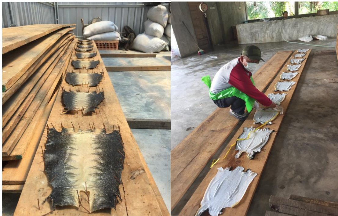
Figure 2. (a) a set of Water monitor skins on a wooden board using nails (b) We measured the width of Water monitor skin before being set for drying

There is a tendency towards adult medium-sized lizards being delivered by hunters in Tanjung Balai. Reptile collectors in North Sumatra are able to identify demands of Water monitor meat and supply these demands out of harvested lizards that are also valuable for their skin. Live lizards of 3 kg total mass would be sold as meat of 2 kg with a price of IDR 8,000 per kilogram. In Inderapura, price per kilogram Water monitor meat is IDR 10,000, which is also the price of Water monitor meat in Pontianak, West Kalimantan (Mirdat et al. , 2019). Lizards with body mass of more than 10 kg were less valuable for fast cash because their skin is difficult to process for leather in tanneries. Skins were measured for its width as one of the requirements for determining its price. Wet skins were set by nailing them down on a wooden board before drying under the sun (Figure 2a).