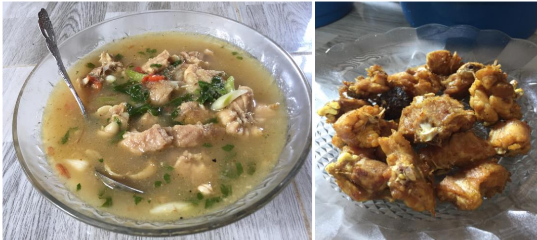
Figure 5. Water monitor meat, fat, and liver prepared by a Javanese family: soup (left) and deep-fired (right)

and skin production. Our hunter interviewees mentioned that they have actively hunted for Water monitors for commercial purposes since the beginning of 1990s. During this period of thirty years, they never found difficulty finding the animals in their neighboring areas such as plantations and wetlands. Some of these abattoirs even now have been passed on to run by the younger generation in the family such as sons and nephews. Thus, the trade of Water monitors has been a family business that seems to be a source of stable income for relatively long time.