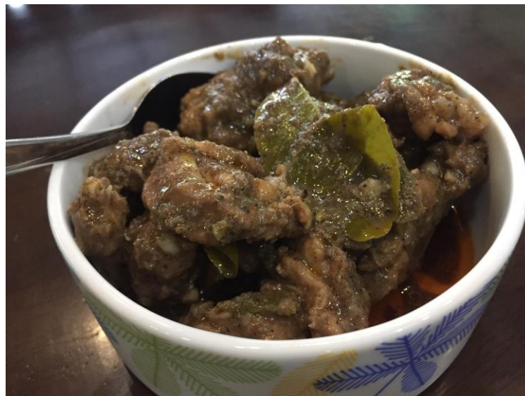
Figure 4. A bowl of curried Water monitor meat as a complimentary dish for “tuak” drinking in Lapos in North Sumatra

We observed the local methods to prepare meat and identified the resulting three different types of dish, namely curry, soup, and deep-fried meat. A Batak woman in Inderapura who owns a local pub bought 10 kg Water monitor meat and prepared for a curry dish (Figure 4) to complement the consumption of traditional alcoholic drink called “tuak”. Demands of Water monitor from Lapos may reach 20 kg per day; however orders only come after 2-3 days in a week. The dish was cooked with various spices, including “andaliman”, shallots, garlic, ginger, onion spring, kaffir lime leaves, chilies, and pepper. The dish was salty, which was deliberate so that customers will buy more drinks in the pub. One portion of curried Water monitor meat costs IDR 20,000. Similarly, the Dayaks in West Kalimantan also consume Water monitor meat sold in local wildlife restaurants called “Amboyo”, where it is usually prepared in two types of dish, i.e. clear soup and spicy stew termed as “rica-rica” (Mirdat et al. , 2019).