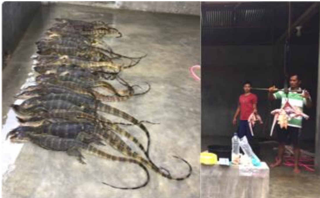
Figure 3. (a) Various sizes of Water monitor before skinning (b) Skinned lizards for subsistence and sale

We have the impression that only lizards of adult size were taken and processed in the abattoirs, although there is no regulation on body size limit for commercial harvest of Water monitor in Indonesia. Lizards of approximate SVL of 40.00 cm (males) and 48.00 cm (females) are mature individuals capable of reproduction (Shine et al. , 1998), therefore immature individuals did not seem to be harvested. Unless we know the sex of these lizards individually, we cannot estimate the reproductive status of these harvests. Figure 3 illustrates the different sizes of Water monitor taken in an abattoir.